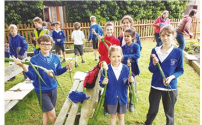
Market Garden, Marble Hill, Twickenham, The Environment Trust, London TW1